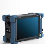
Platform FTB-2/FTB-2 Pro