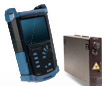
Compact Platform FTB-200